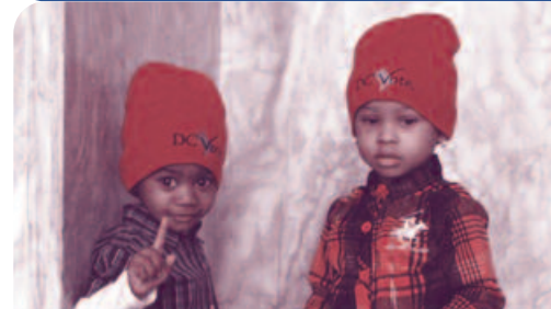
Two young activists show their support