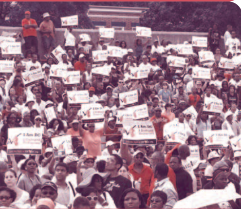
The crowd demands democracy at the Reclaim the Dream Rally