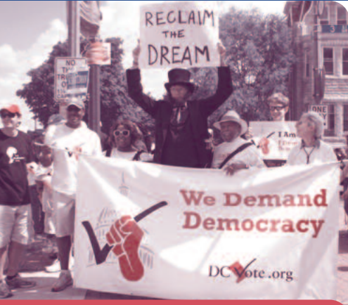
"Abe Lincoln" supports DC voting rights at the Reclaim the Dream rally