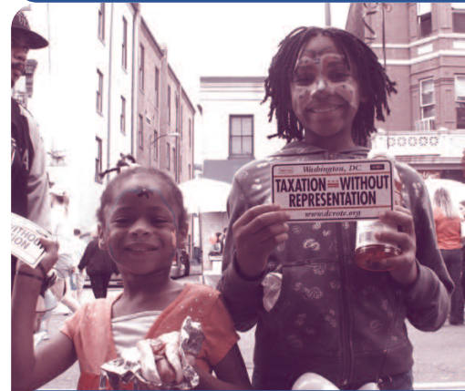
Hundreds of new supporters were recruited at summer festivals