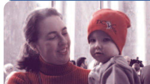
Supporters at DC Vote rally in the Rayburn House Office Building foyer