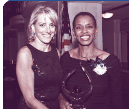
Ambassador Elizabeth Frawley Bagley (L) accepts her husband's award from Rep. Donna Edwards