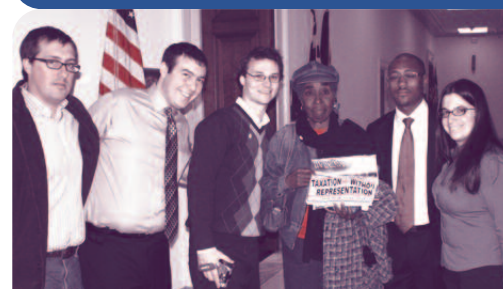
A team pauses between lobby visits to Congressional offices