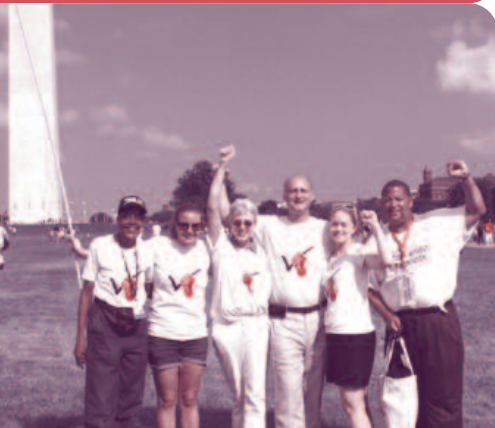
Some members of the DC Vote team Demand Democracy on the Mall